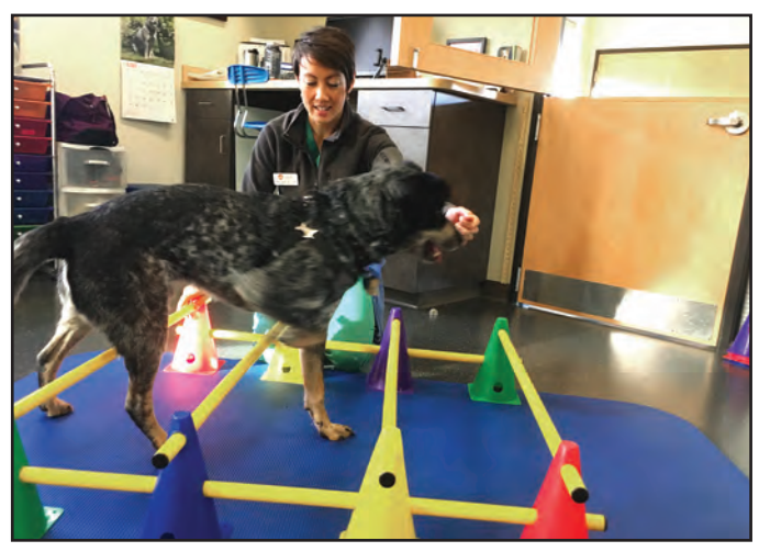
Figure 2. Cavaletti Rails. Rangler navigating Cavaletti rails for range of motion and strength.

Rangler continues with physical rehabilitation weekly to build and maintain strength in his limbs, as well as work on core strength to protect his spine. Rangler's mild proprioceptive deficits and mild hyperesthesia suggest that he may have some mild compressive disease process in his spine, but an MRI is not indicated at this time given his high level of function and comfort. He discontinued acupuncture at the end of July 2017 to focus on physical rehabilitation. Rangler is able to walk from his home all the way to the clinic and back, 1 mile each way, in addition to going to daycare and playing with housemates, all without lameness. Rangler thoroughly enjoys his rehabilitation sessions and has made huge strides in not only his physical strength and coordination, but his confidence and fear behaviors as well. He has a wonderful quality of life, and is maintaining his owner's goals of being happy, painfree and active.