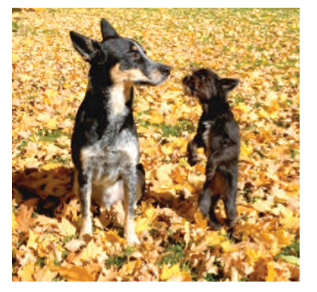
Scout & Luna – Truly the Best of Friends!

"I was informed by authorities that my mother was a large Black Bear, but apparently my DNA test indicated otherwise. I'm just a little Chorkie."